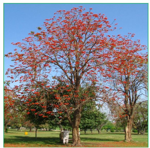
Fig. 1. Tree of Erythrina suberosa (A Natural Dye Bearing Plant)

optimized dyeing conditions namely dye extraction time 60 min, material to liquor ratio 1:20, dyeing time 50 min. The mordant combinations viz. Lemon juice: copper sulphate, lemon juice: potassium dichromate, lemon juice: ferrous sulphate, lemon juice: stannous chloride was used in the ratio of 1:3, 1:2 and 3:1. The total amount of two mordants used in each combination was 5% on the weight of the fabric i.e. 5 gm of the mordant / 100 gm of the fabric. Each of the five mordant combinations in three different ratios mentioned above were used with all the three mordanting methods namely pre mordanting, simultaneous mordanting and postmordanting for dyeing. After dyeing, the solution was allowed to cool, removed from dye bath, rinsed under running water to remove excess dye particles and shade dried.