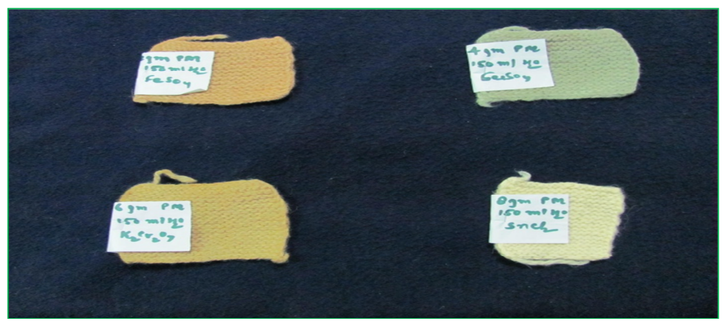
Fig. 3. Dyed samples for Pre-Mordanting method followed by four different Chemical Mordants with few drops of lemon juice as Natural Mordant