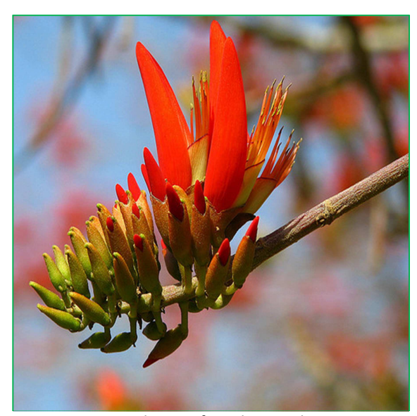
Fig. 2. A Flower of Erythrina suberosa

crock meter and grey scale as per ISO-105-AO3 (extent of staining). Colour fastness to exposure to light was determined as per IS: 2454- 1984 method. The sample was exposed to UV light in a Shirley MBTF Microsal fade-O-meter (having 500 watt Philips mercury bulb tungsten filament lamp simulating day light) along with the eight blue wool standards (BS1006: BOI: 1978). The fading of each sample was observed against the fading of blue wool standards (1-8). Colour fastness to perspiration13 assessed according to IS 971-1983 composite specimen was prepared by placing the test specimen between two adjacent pieces of wool fabric and stitched all among four sides. The sample was soaked in the test solution (acidic/alkaline) separately with MLR 1:50 for 30 minutes at room temperature. The sample was then placed between two glass plates of perspirometer under load of 4.5kgs (10 lbs). The apparatus was kept in the oven for four hours at 37±2°C. At the end of this period the specimen was removed and dried in air at a temperature not exceeding 60°C. The test samples were graded for change in colour and staining using grey scales.