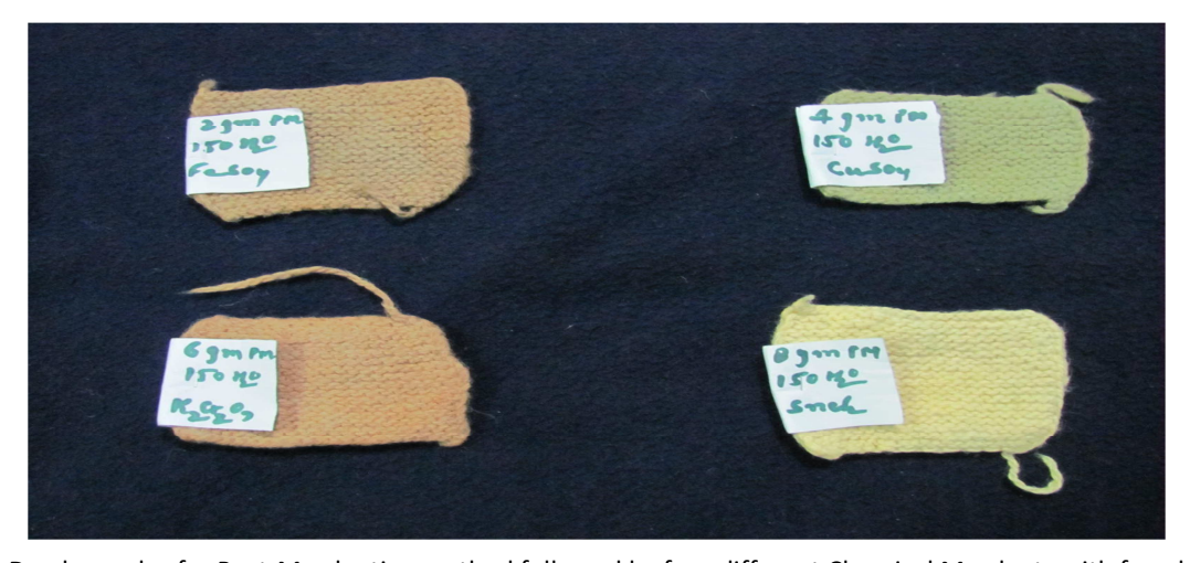
Fig. 5. Dyed samples for Post-Mordanting method followed by four different Chemical Mordants with few drops of lemon juice as Natural Mordant